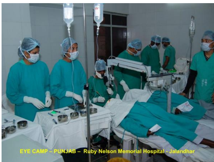
EYE CAMP - PUNJAB - Ruby Nelson Memorial Hospital - Jalandhar